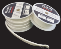
Gasket & Sealing Tapes

Weiconlock AN 305-77 is a high quality grade of anaerobic adhesive designed specifically for pipe and thread sealing applications.