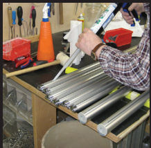
MS Polymer Adhesives & Sealants