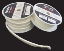
Gasket & Sealing Tapes