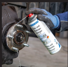
Cleaning & Degreasing