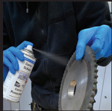
Surface & Corrosion Protection