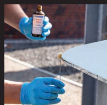
Primers & Accessories