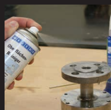
Cleaners & Degreasers

VA 8312 Cyanoacrylate has a low viscosity and is ISEGA Certified for use in the food and beverage sectors. This glue is a viable option for many hard to bond plastics when used in conjunction with our CA Primer.