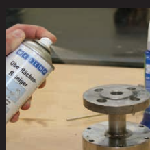
Cleaners & Degreasers