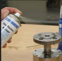
Cleaners & Degreasers

This industrial-grade super glue is also NSF registered and widely used for bonding in the food and beverage industries.