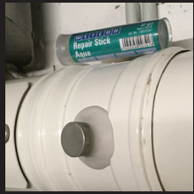
Epoxy Repair Sticks