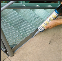
Urethane Adhesive Sealants & Compounds