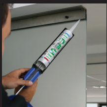
Dispensing, Cleaning & Accessories

Primer M 100 is used in conjunction with Weicon Urethane and MS Polymer based adhesive sealants.