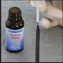
Primers & Enhancers