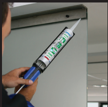
Dispensing, Cleaning & Accessories

Primer K 200 is used in conjunction with Weicon Urethane, MS Polymer and/ or Silicone based adhesive sealants.