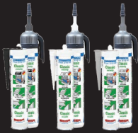
MS Polymer Adhesives & Sealants