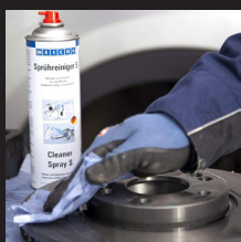
Cleaners & Degreasers

Weicon Easy-Mix S 50 Yellow Epoxy Adhesive is a fast-curing, high quality epoxy adhesive that is ideal for quick repair and maintenance jobs.