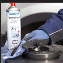
Cleaners & Degreasers

A versatile epoxy adhesive made from steel filled epoxy resin supplied in a two-part syringe cartridge.