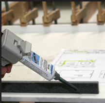
Dispensing Equipment & Accessories