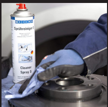
Cleaners & Degreasers

Easy-Mix HT 180 is a high temperature resistant grade of epoxy glue.