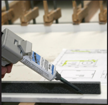
Dispensing Equipment & Accessories