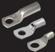
Cable Lugs & Links