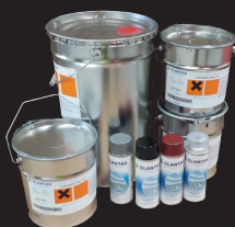
Insulating Putties, Varnishes & Compounds