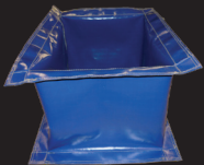
Custom Heat Insulation Solutions

Offers very high temperature resistance, low thermal conductivity, low heat storage and excellent compression recovery.