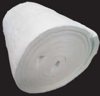
Flexible Insulation Materials