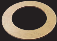
Filled PTFE Gaskets and Sheet

BlueGard 3000 is available from Associated Gaskets in sheet or cut gaskets. BlueGard Gaskets can be manufactured to suit standard flanges or your custom requirements.