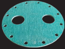
Compressed Fibre Gasket Sheets

A quality, general-purpose grade of compressed fibre gasket sheet. Blue-Gard 3000 is made from a combination of aramid fibres and an NBR rubber binder.