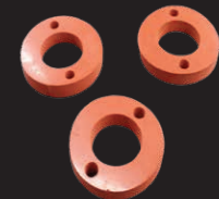
Premium Rubber Gaskets and Sheets