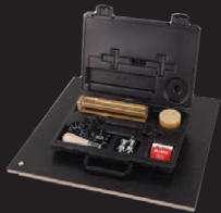
Gasket Cutting Tools and Accessories