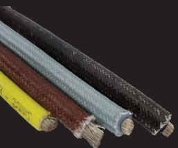
Cable & Wire

This highly conformable tape is easy to apply and provides good electrical insulation performance in temperatures up to 130°C.