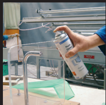
Cleaning & Degreasing Sprays & Liquids