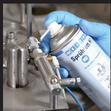
Adhesive Lubricant & Grease Sprays