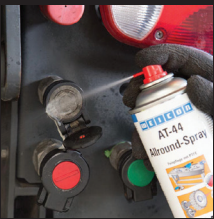
Lubricating & Multi-Functional Sprays & Liquids