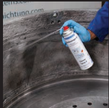
Cleaners & Degreasers