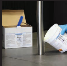
Liquid Epoxy Resins & Adhesives