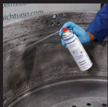
Cleaners & Degreasers