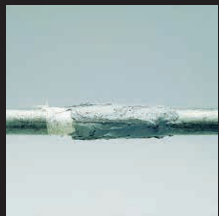
Accessories & Application Aids

This two part compound exhibits a combination of strength, adhesion and long lasting performance.