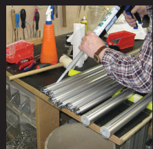
MS Polymer Adhesives & Sealants