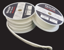
Gasket & Sealing Tapes