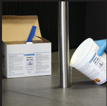
Resins & Compounds