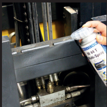
Lubricating & Multi-Functional

A release agent that prevents adhesion to plastics, moulds, metals and tools.