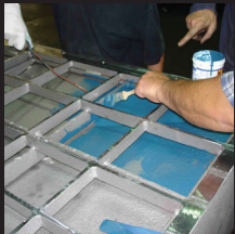
Plastic Metal Epoxy Systems