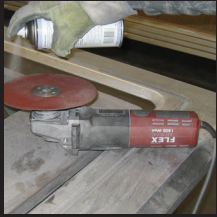
Solvents & Release Agents