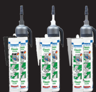
MS Polymer Adhesives & Sealants