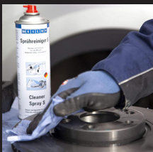
Cleaners & Degreasers

Weicon Easy-Mix N 50 Epoxy Adhesive is a high quality adhesive designed with an extended cure time. Because of this, this adhesive is ideal for applications where parts may need to be repositioned after the adhesive is applied such as in manufacturing lines or even precision repair work.