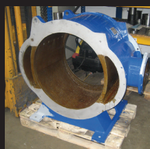
Putties & Compounds

The Aqua Repair Stick is ideal for making quick repairs to damp and wet surfaces and even in underwater applications.