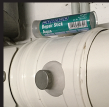
Epoxy Repair Sticks