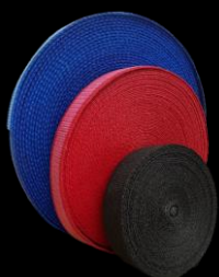
High Temperature Insulation Tapes