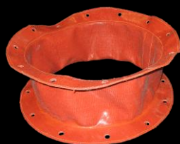
Custom-Made Thermal Insulation