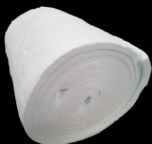
Insulating Blankets & Batts