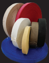
Thermal Insulation Tapes

AG's Refrasil Sleeveings are braided from high purity silica fibres whist have been specially treated, pre-shrunk and texturised.