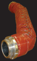
Thermal Ropes & Sleeveings