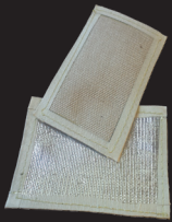
Fiberglass Insulation Cloths