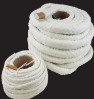
Insulating Ropes, Sleeving and More